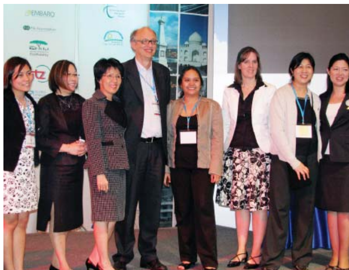
Group photograph at the end of the workshop